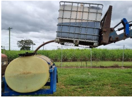
Gravity transfer of Bio-Booster