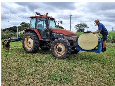
Preparation of Tractor tank