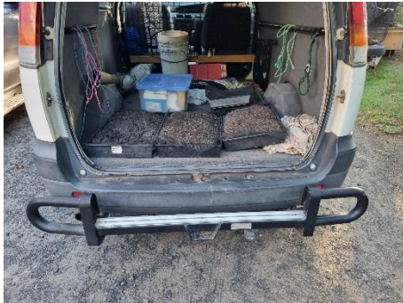
Delivery of Starter