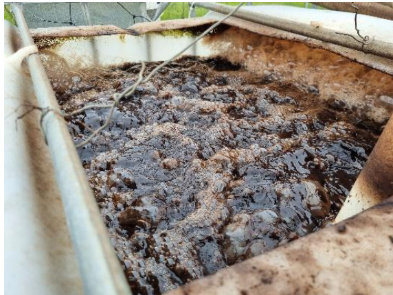
Surface of Brew