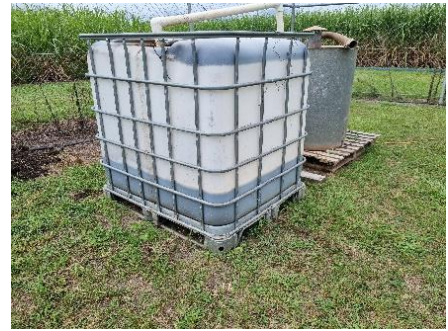
Remainder of Bio-Booster aerating for application tomorrow