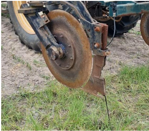
Testing of Bio-Booster application