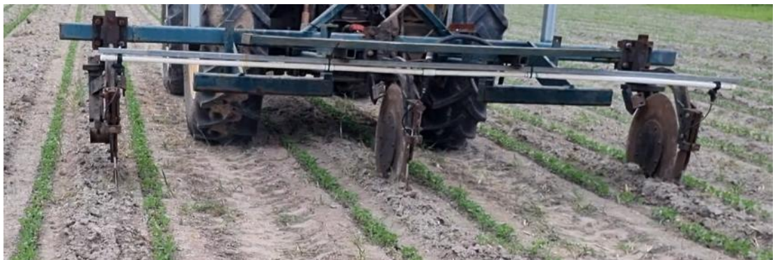
Make a Record of trial rows without bio-Booster - remainder Treated